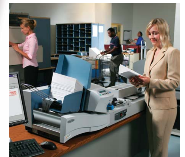
DA75S Envelope Printer shown with optional power stacker and dryer