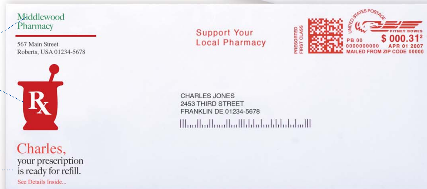
Print logos or high-impact graphics in brilliant color.